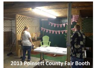
2013 Poinsett County Fair Booth