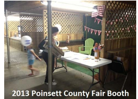
2013 Poinsett County Fair Booth

This year we handed out "Rainbow Beans" (chocolate covered soybeans), and they seemed to be a big hit with the children as well as adults. We also handed out pencils labeled with Poinsett County Conservation District information on varying seed packets. The Poinsett County Conservation District looks forward to doing another booth in the upcoming year.