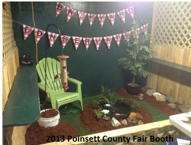
2013 Poinsett County Fair Booth